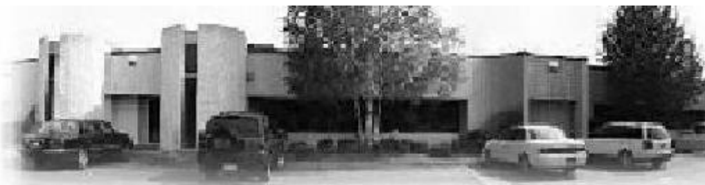
Merrell Institute Headquarters, Long Island, New York Campus 1461 Lakeland Ave, Bohemia, NY 11716 631-563-7720 Fax: 631-563-7719

WWW.MERRELLINSTITUTE.COM WWW.MERRELLEDUCATION.COM